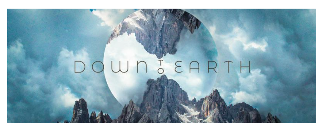
Today's Sermon: What Active Learners Do