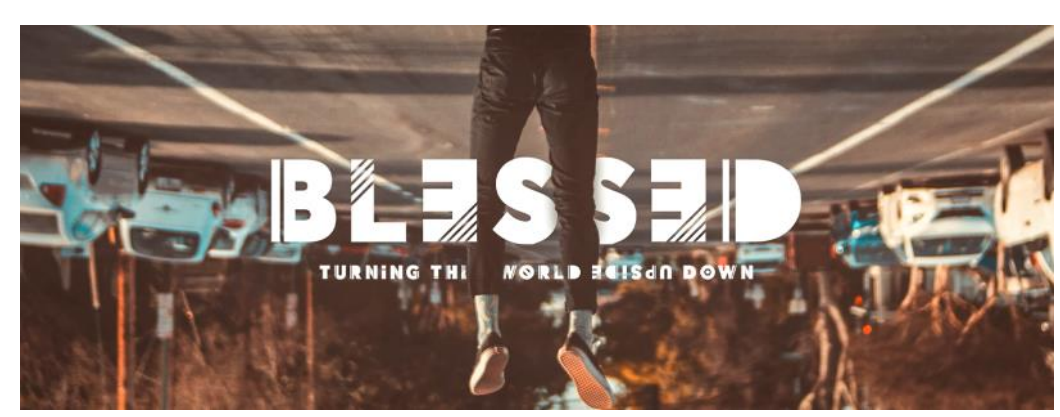
Today's Sermon: Blessed Are Those Who Mourn